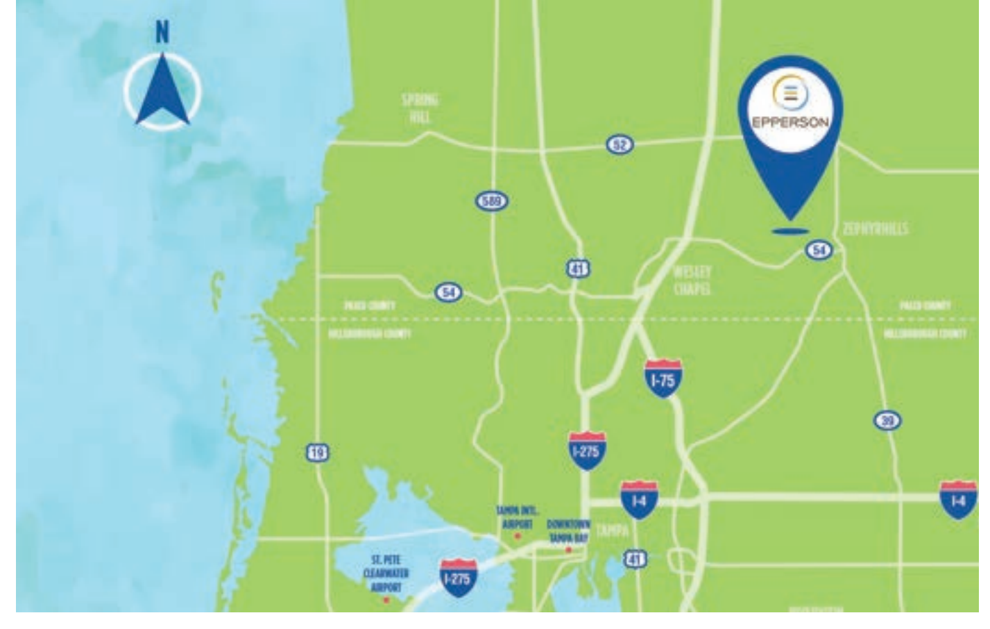
Take I-75 to EXIT 282 (Overpass Road). Head EAST on Overpass Road for 2 miles.